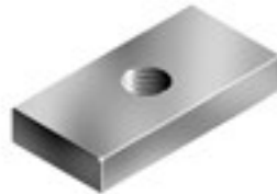
Gewindeplatte Threaded Plate